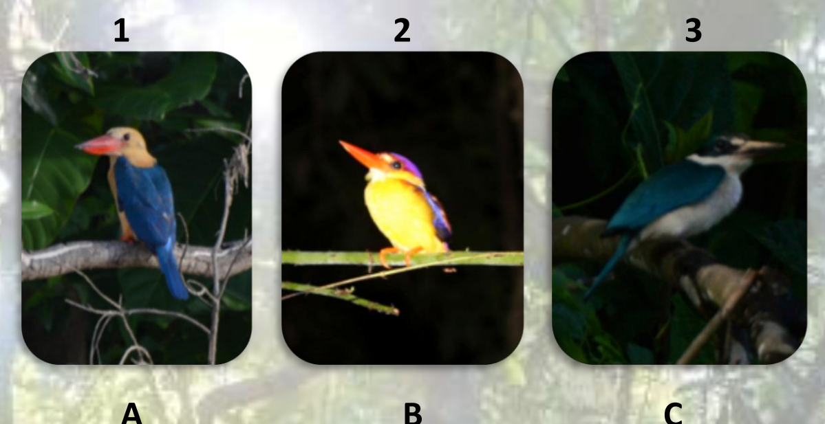
A Oriental dwarf kingfisher

Pictured below are three species of Kingfisher that can be found on the Kinabatangan River. Try and match the species to the photo!