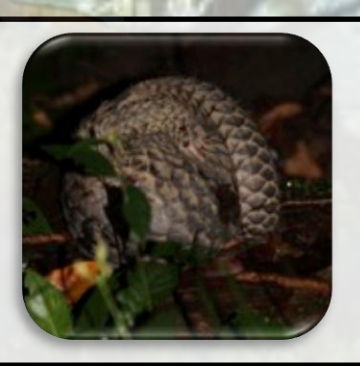
Page 18: Pangolin Release