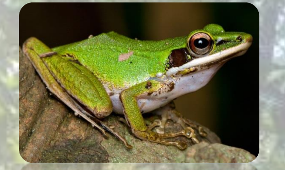
Hylarana raniceps, most abundant species found in epiphytes