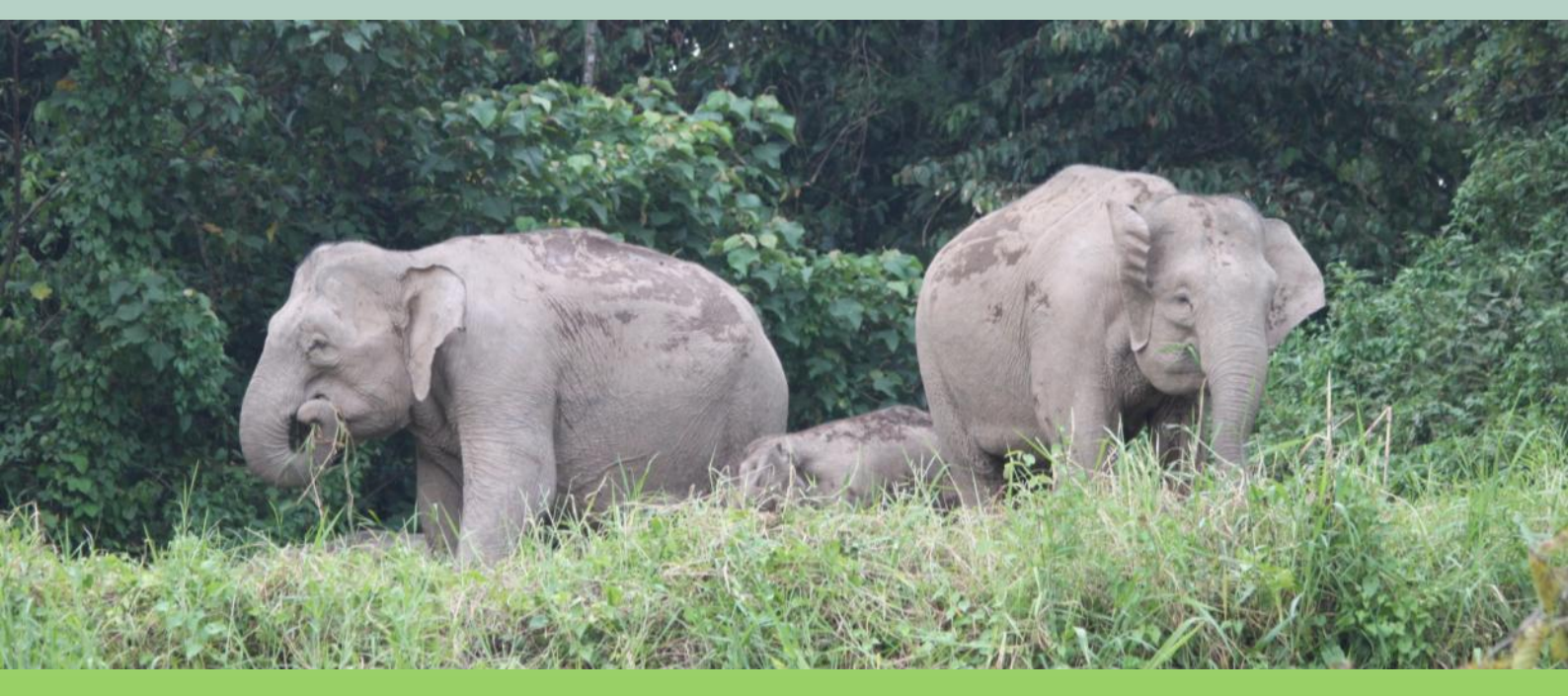
For updates on the movements of the collared elephants, Aqeela and Liun, check out our Facebook page