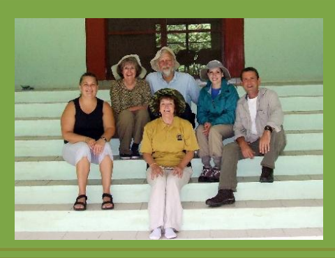
New York visitors on page 6