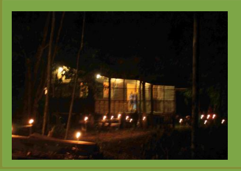
Hari Raya at DG on page 5