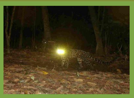
Camera trapping special on page 8