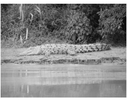
A large crocodile.