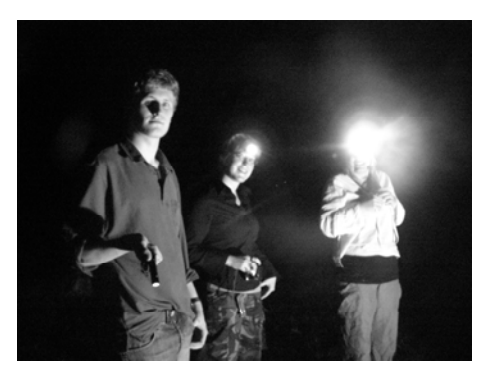
Students sample invertebrates by night at DGFC.

Danau Girang is owned by the Sabah Wildlife Department and supported by Cardiff University. Its purpose is to further scientific research with the aim of contributing to long-term conservation projects in the area, and develop a better understanding of our environment and the living things we share it with.