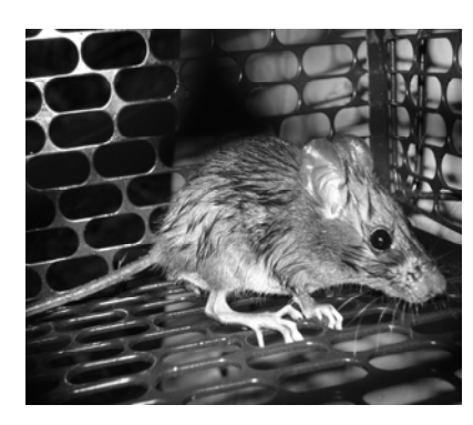
The 'Danau Girang Bumblebee Mouse', so called due to its stripy fur coat.

Sunday 27th July, by Thursday lunchtime a statement was released to declare that at the first count, 52 small mammals and one bird had been captured. The editor of 'Psychic Weekly' is said to be eagerly looking forward to its first subscriber.