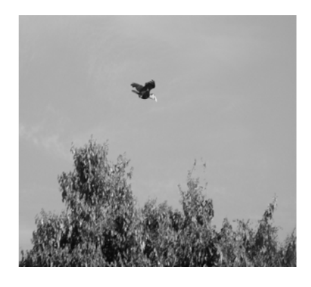
Hornbill in flight.

The Kinabatangan is home to several species of hornbill, including the pied hornbill, rhinoceros hornbill and wrinkled hornbill