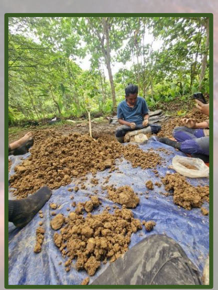
Separating the soil from the roots can be a very muddy task as seen here at the Ladang site.