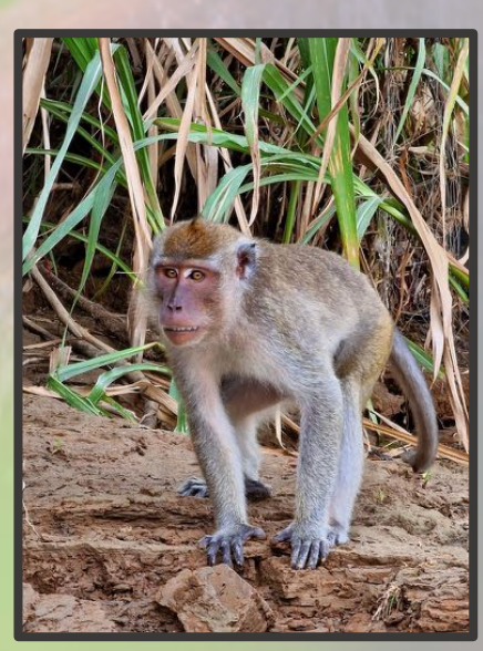
Long Tailed Macaque. A cheeky grin for the camera.