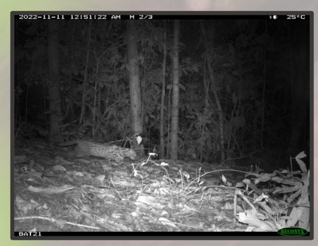
Leopard Cat. They aren't usually spotted on the Batangan ridge, preferring the surrounding plantations for ease of hunting.