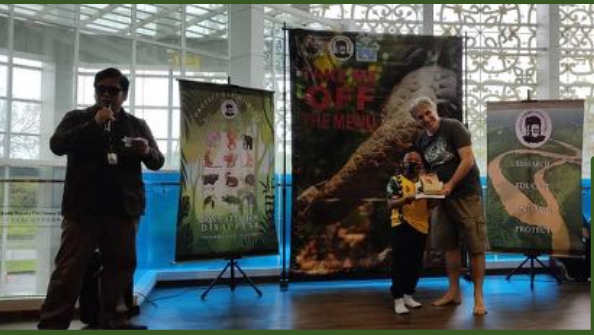
(Above) Prizes were awarded to the children for the interactive games and activities. (Credit: DGFC Education Team)

(Below) A variety of activities were on offer, such as the colouring in of Sabah's incredible wildlife. (Credit: DGFC Education Team)