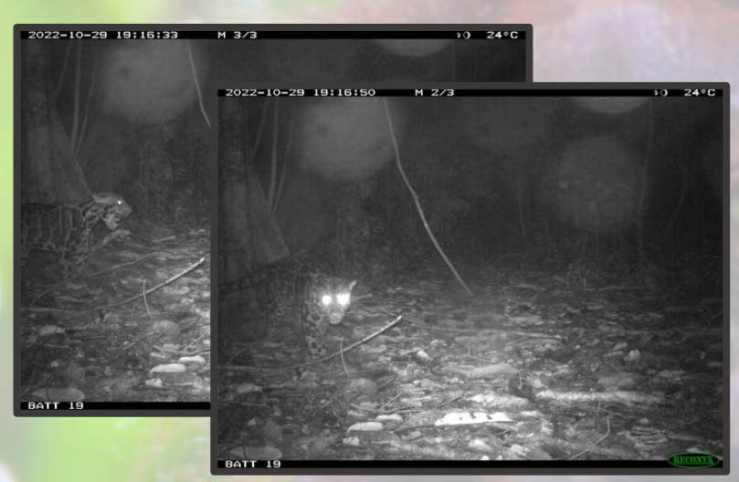
Sunda Clouded Leopard. They stopped for a yawn before spotting our camera.