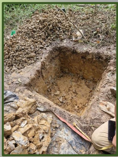
As part of the carbon sampling root samples are taken at depth intervals of 0-10cm, 10-25cm and 25-60cm.

For full information see the Regrow Borneo annual report 2021-2022 which can be downloaded from the following link: <a href="https://tinyurl.com/Regrowborneo">https://tinyurl.com/Regrowborneo</a>