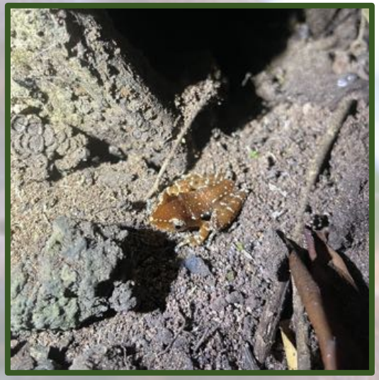
Cinnamon frog

The Lower Kinabatangan Wildlife Sanctuary (LKWS) is a 270km<sup>2</sup> sanctuary comprising 10 forest lots of varying degrees of historical disturbance predominantly dominated by oil palm plantations. Despite extensive forest fragmentation and degradation, the LKWS supports an incredibly high amount of biodiversity and is, therefore, the ideal natural laboratory to evaluate the impacts of habitat fragmentation on wildlife populations.