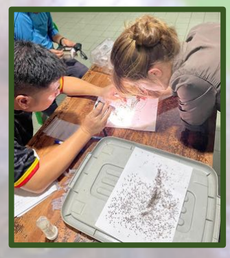
Mosquito species identification and sorting