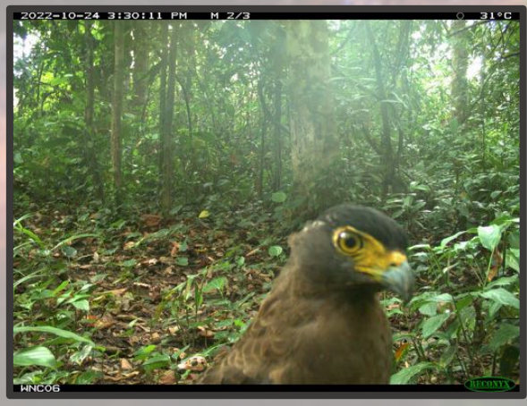
Crested Serpent Eagle. Curious about our camera trap.