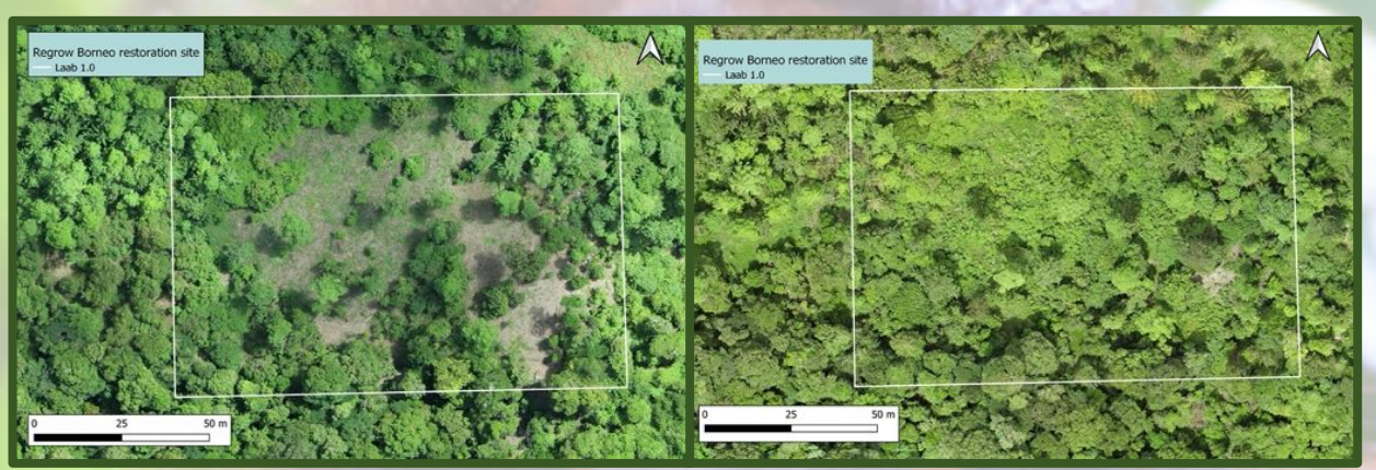
The Laab site one year ago (pre planting).