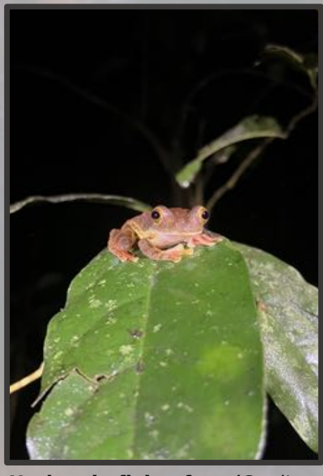
Harlequin flying frog