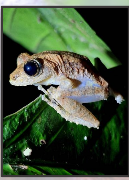
Frilled tree frog